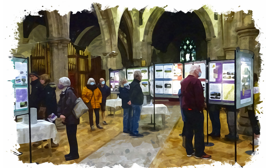
Public Exhibition in St John the Baptist Church 2021

The Tibshelf Parish 2011 Census Profile was prepared by Andrew Towler Associates on behalf of Tibshelf Parish Council — March 2018